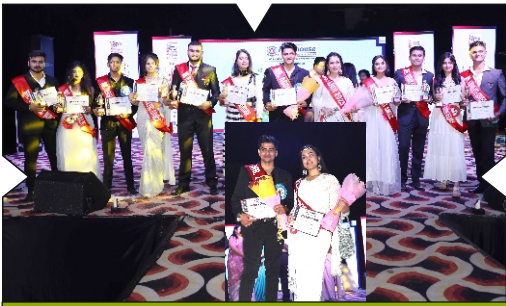
Reeth 2023- The Fresher's Party