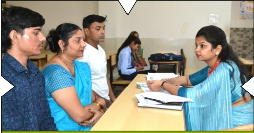
Parents Teacher Meeting on 28th October 2023 for BBA and BCA students