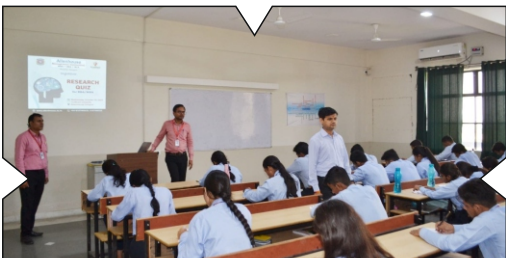
Analista-The Research Club: Research Quiz will test the participant's understanding & capabilities in Research Aptitude