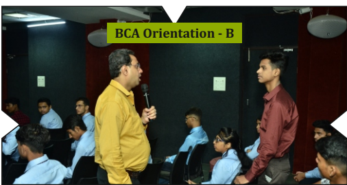
BCA Orientation - B