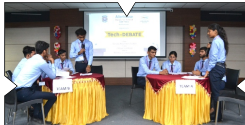
Ingenuim- The literary club events: 'TECH DEBATE' on AI, Cybercrime & Dark web.