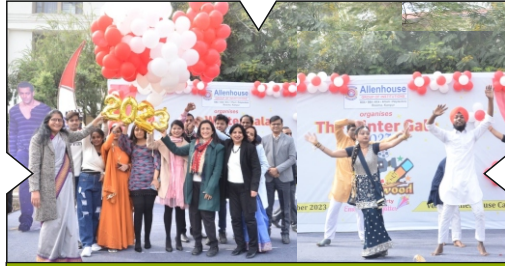
Winter Gala-2023, a Bollywood Themed New Year Celebration