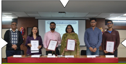
Research & Extension Association for Conservation Horticulture & Agro-forestry (REACHA) signed a Memorandum of Understanding (MoU).