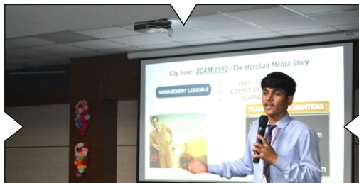
Allenscreen- The Movie Club events: 'Managing the Reel World: Lessons from Movies.'