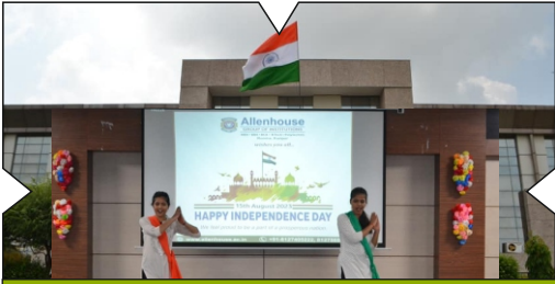
On 77th Independence Day students showcased their patriotism