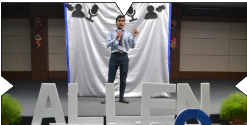
AllenTalk 2.0, Participants Mesmerized the audience with their Exhilarating Performances