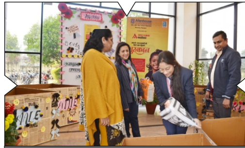
CSR Activity by Samarthan Club: Cloth Donation Drive under the Amar Ujala "Muskaan" campaign