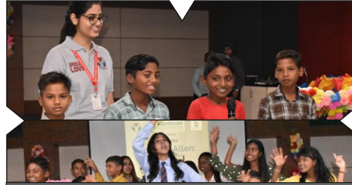
CSR Activity by Samarthan Club: "Utsav-e-Allen- Light up Lives" for under-privileged children with 'Close to my Heart' NGO