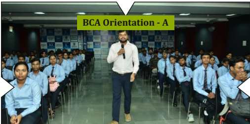
BCA Orientation - A