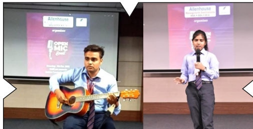
An Open Mic Event in the field of literature, poetry, public speaking & other interesting categories